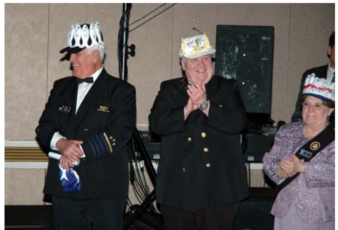
Tom Cod Foolery at the District 13 Change of Watch and Spring Conference