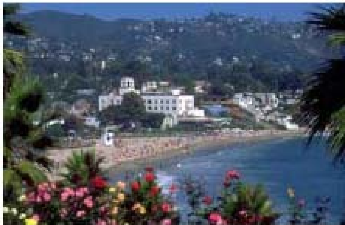
Visit Laguna Beach, Calif., during the 2009 USPS Annual Meeting in Anaheim, 17–22 Feb.

Along with the environmental spices program, the new SoundCitizen effort offers opportunities for people who'd like to help find out what's in rain water coming out of their roof gutters or about to go into city street drains. Volunteers are welcome to choose what they want to sample according to the Web site at http://www.soundcitizen.org . That's also where volunteers will find the data they've helped to collect and perhaps propose additional questions for research. To reach SoundCitizen, call Kimball at (206) 221-6747 or brittanykimball@soundcitizen.org .